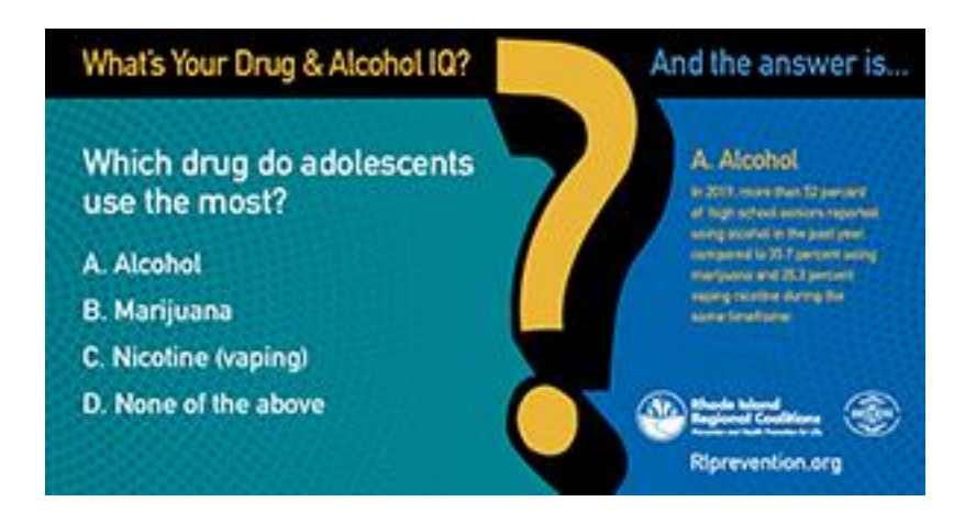
DAY 2 - Post Question #2 image. Optional text post below

A. Alcohol. For more information, refer to the National Institute on Alcohol Abuse and Alcoholism's "Underage Drinking" fact sheet: