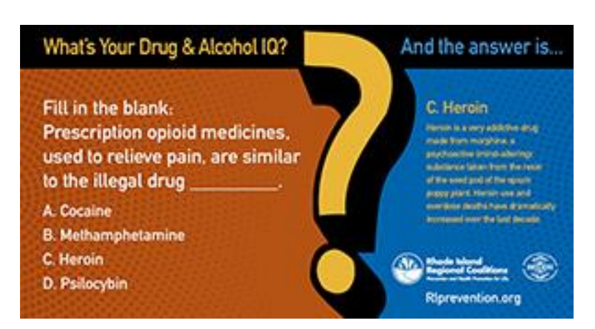
DAY 4 - Post Question #4 image. Optional text post below

C. Heroin. Read more about heroin: <a href="https://teens.drugabuse.gov/blog/category/opioids-and-prescription-drugs">https://teens.drugabuse.gov/blog/category/opioids-and-prescription-drugs</a>.